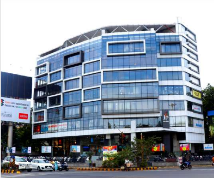
JP Square, Nagpur