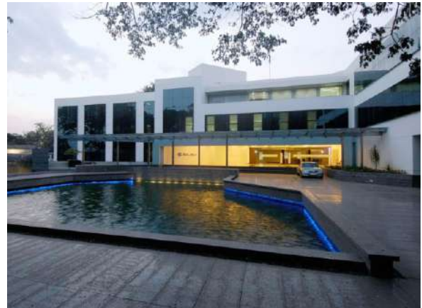
Bajaj Auto, Pune