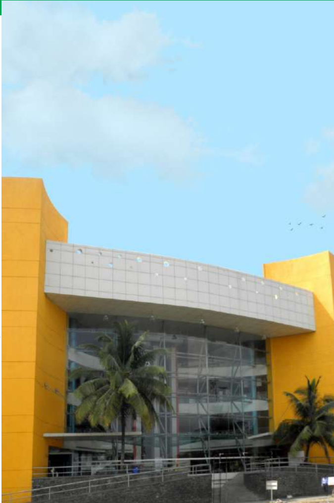
Abhiruchi Mall and Multiplex, Pune