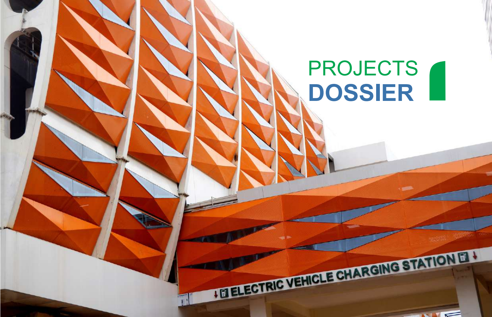
AIRPORT METRO STATION, NAGPUR