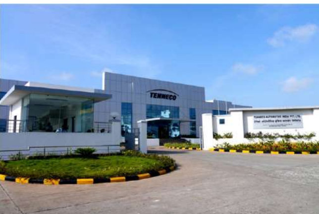
Tenneco India, Pune