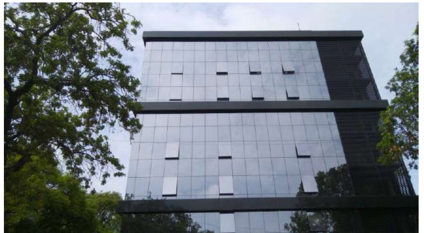
RIAN House, Nagpur