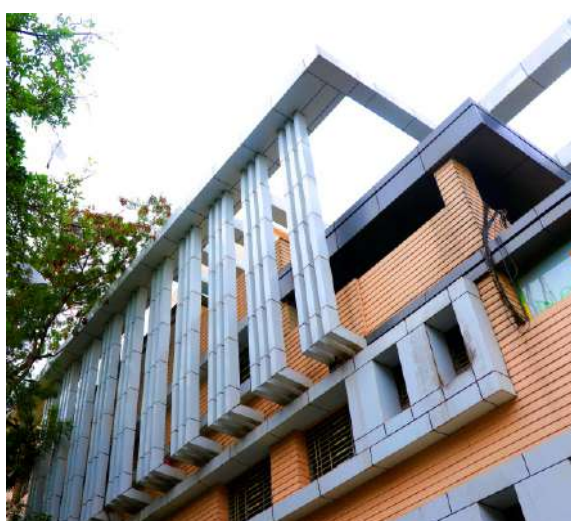
Neuron Hospital, Nagpur