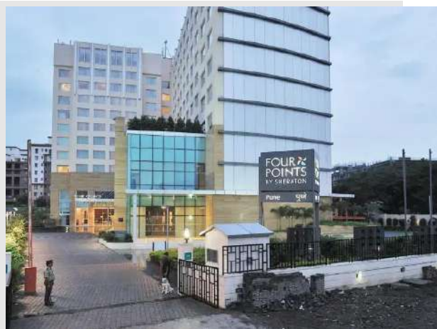
Four Point Sheraton, Pune