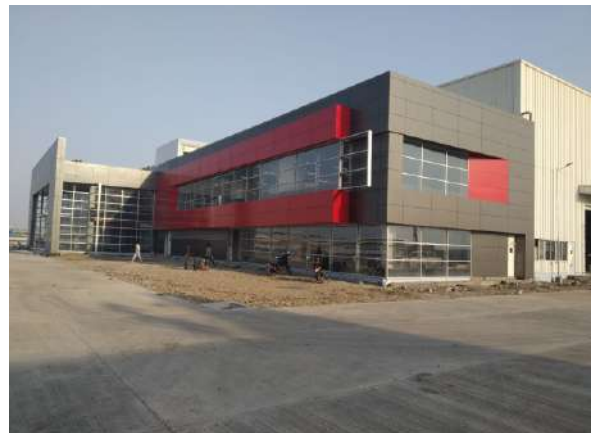
OLCI Engineering, Pune