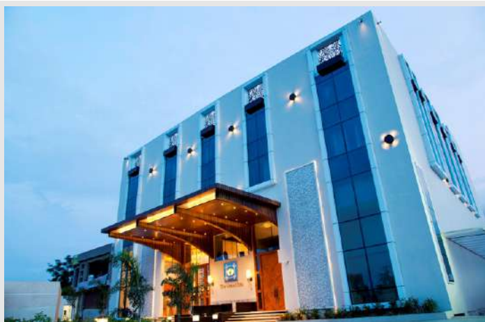
Hotel Grandsita, Gondia