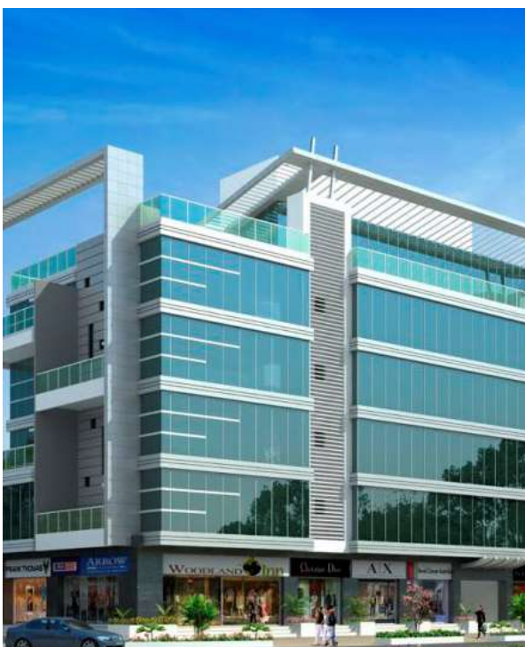
The Capital, Pune