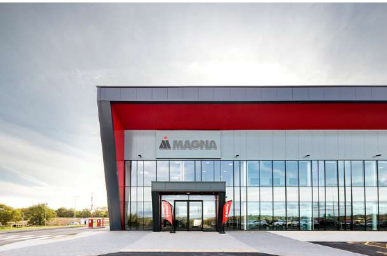
MAGNA Cosma, Chennai