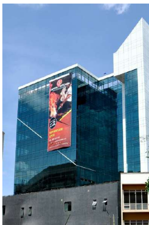
Thobani Centre, Nairobi